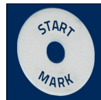
Close-up of the start/mark switch