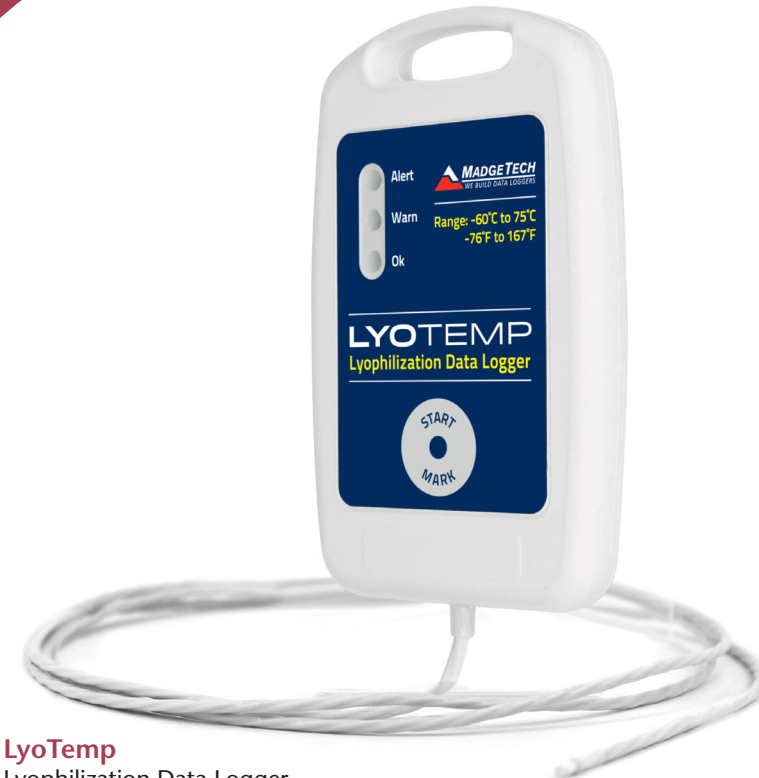
LyoTemp Lyophilization Data Logger

See MadgeTech's terms and conditions at www.madgetech.co.nz